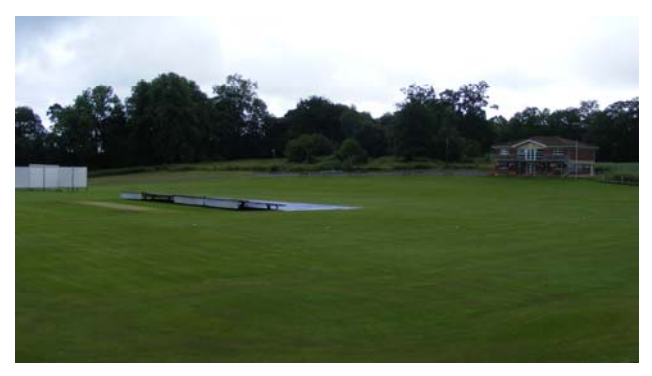
The Lawn, Waringstown