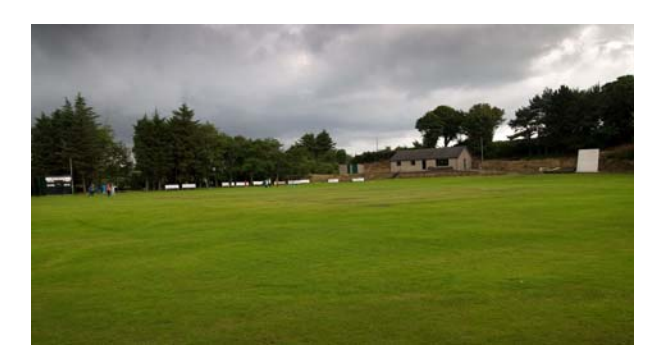
The Meadow, Dundrum

One of the most picturesque grounds in NCU area with the Mourne Mountains in the background. Home ground for Section One club Dundrum and first time for international cricket. 26.5 miles south of Belfast.