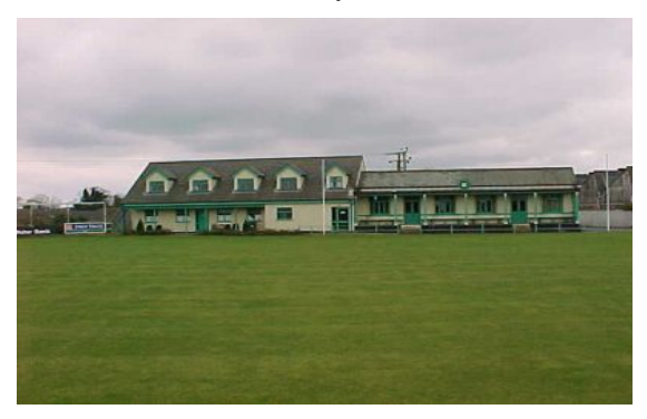
The Green, Comber

Host of past international games, long successful history and home for the current Premier League champions North Down. Arguably the driest ground in NCU area, with 2 pitches side-by-side and host of the 2009 NCU T20 finals day. Found 10 miles east from Belfast City Centre.