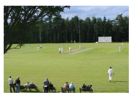
Shaws Bridge, Belfast

Shaws Bridge Sports Association is home for most of the Northern Cricket Union committee meetings. The grounds have 2 pitches and is shared with Premier League team Instonians and Section One club Cooke Collegians. The bottom pitch is due to be used and is a wonderful setting for cricket. 3.5 miles south from Belfast City Centre.