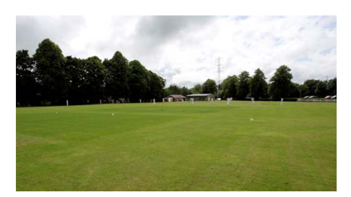
The Vale, Laurelvale