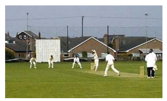
Upritchard Park, Bangor

Premier League club Bangor's home ground. Found 13 miles east of Belfast City Centre. This ground has hosted senior international games and has a reputation for having hard wickets – full of runs.