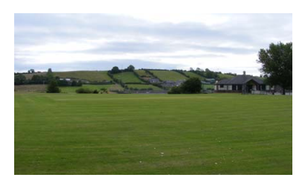
Village Ground, Drumaness