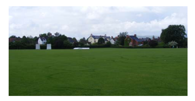
Osborne Park, Belfast