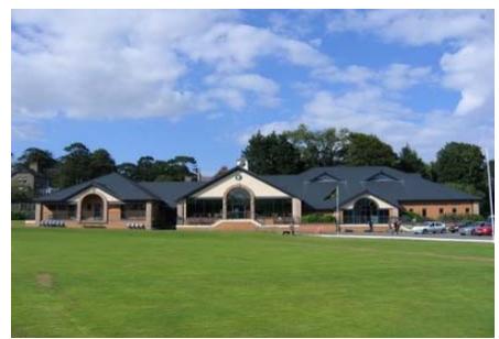
The Meadow, Downpatrick