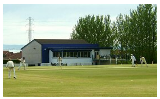
Middle Road, Carrickfergus