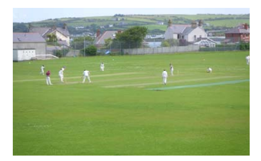
Sandy Bay, Larne

Decent wickets and close to the sea so will be a dry ground – watch out for the passing ferries this time. Home ground to Section Two club Larne and has hosted representative game in the past. Ground is 24 miles north of Belfast.