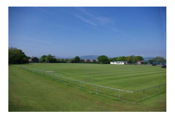
Seapark Oval, Holywood

Home ground of Section One club Holywood. Found on the main Belfast to Bangor road, 6 miles from Belfast City. Ground is only into its 5<sup>th</sup> year and quite a dry ground – if required!