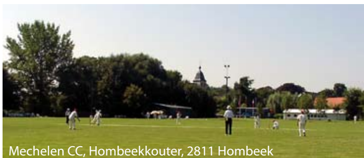
Mechelen CC, Hombeekouter, 2811 Hombeek