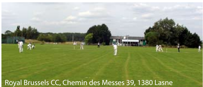
Royal Brussels CC, Chemin des Messes 39, 1380 Lasne