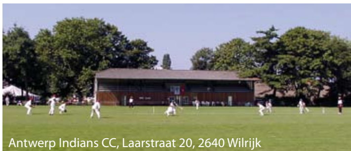
Antwerp Indians CC, Laarstraat 20, 2640 Wilrijk