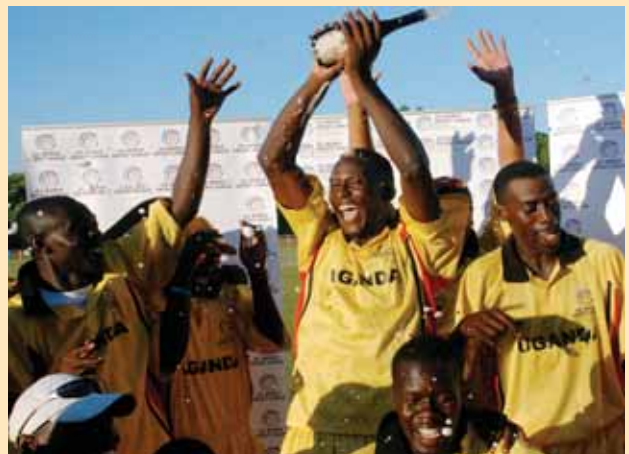
Uganda celebrates winning the Pepsi ICC World Cricket League Division 3 event in May 2007.