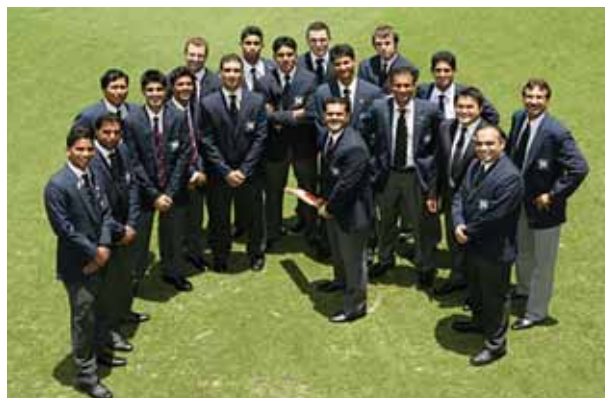
Hong Kong will hope to repeat their success at the ACC Trophy Elite 2008.