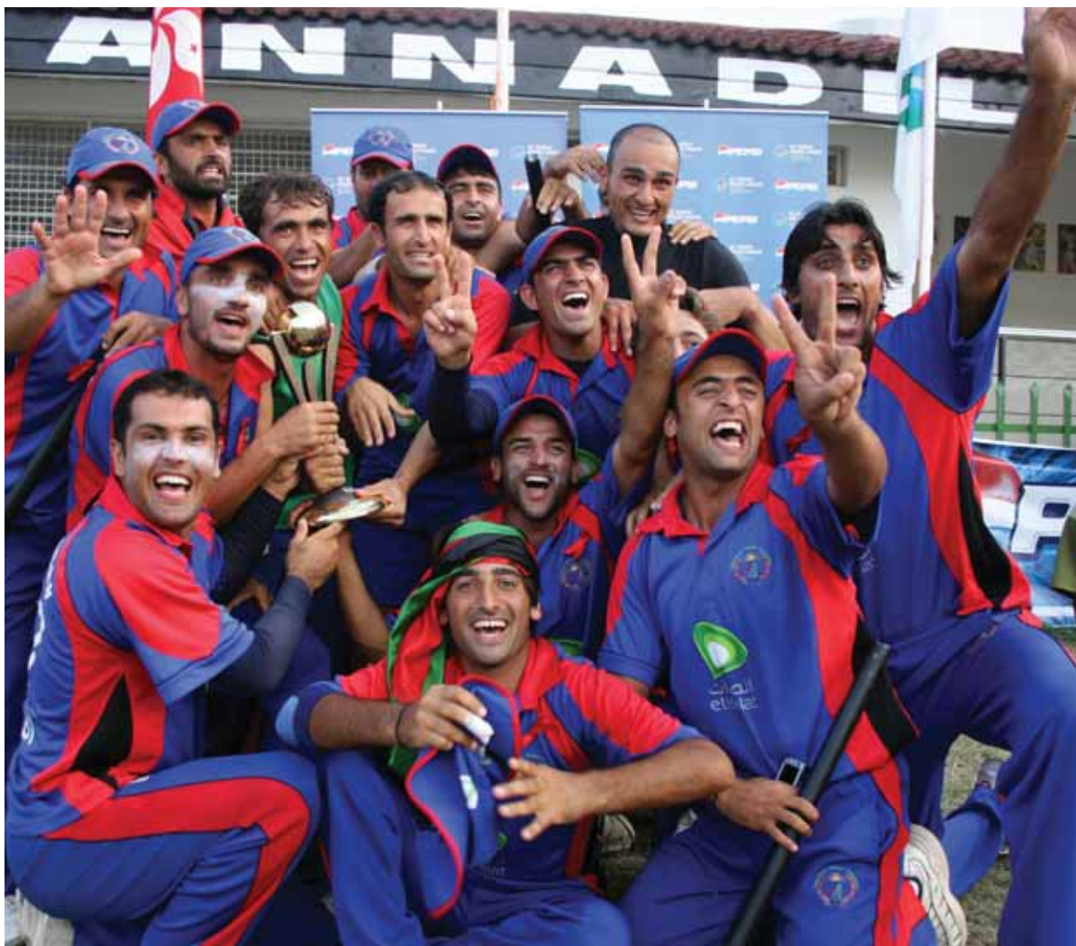
Afghanistan celebrates winning the Pepsi ICC WCL Division 4 event in Tanzania after defeating Hong Kong by 57 runs.

Six ICC Members will be hoping to move closer to qualification for the ICC Cricket World Cup 2011 when they take part in the Pepsi ICC World Cricket League (WCL) Division 3 tournament in Buenos Aires, Argentina.