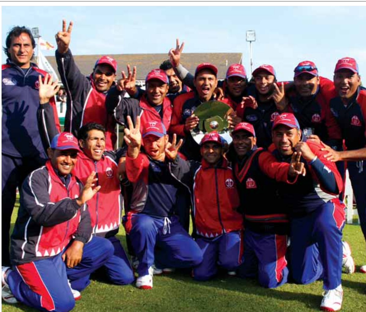
Bahrain will look forward to extend its winning run in the event after winning the Pepsi ICC World Cricket League Division 7 in Guernsey in May 2009.

Six ICC Members will hope to progress on the road to qualification for the ICC Cricket World Cup 2015 when it takes part in the Pepsi ICC World Cricket League (WCL) Division 6 tournament in Singapore.