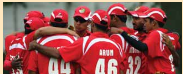
The Singapore team will rely mainly on its dependable batting order and home support to succeed in the event.